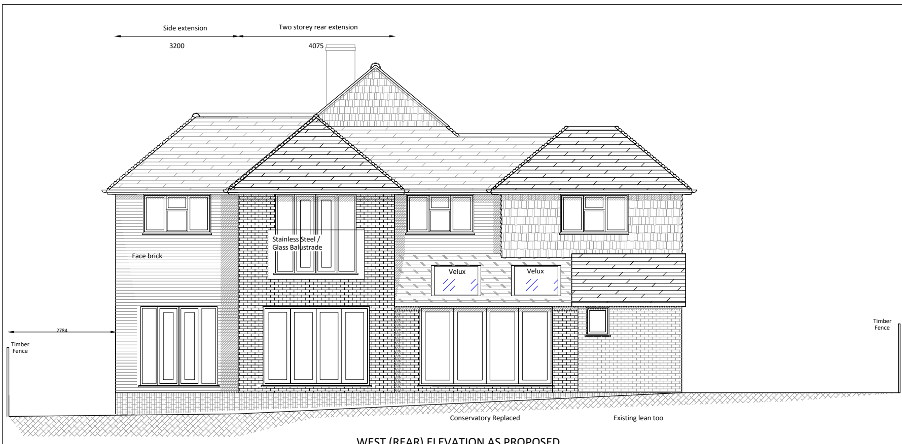
WEST (REAR) ELEVATION AS PROPOSED