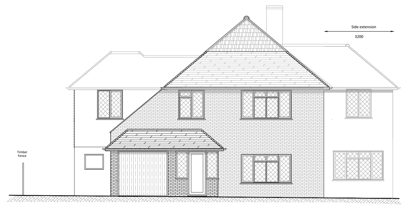
EAST (FRONT) ELEVATION AS PROPOSED